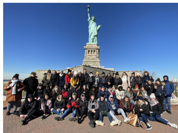
New York, February 2020

We also have regular trips to theatres, art galleries and sites of historic or geographical interest.