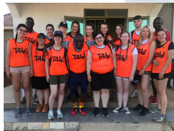
Uganda, July 2019

“Merry House is the best house. We are the sporty house named after Katherine Merry... the Olympian who was one of our ex-students, we always win Sports Day!”